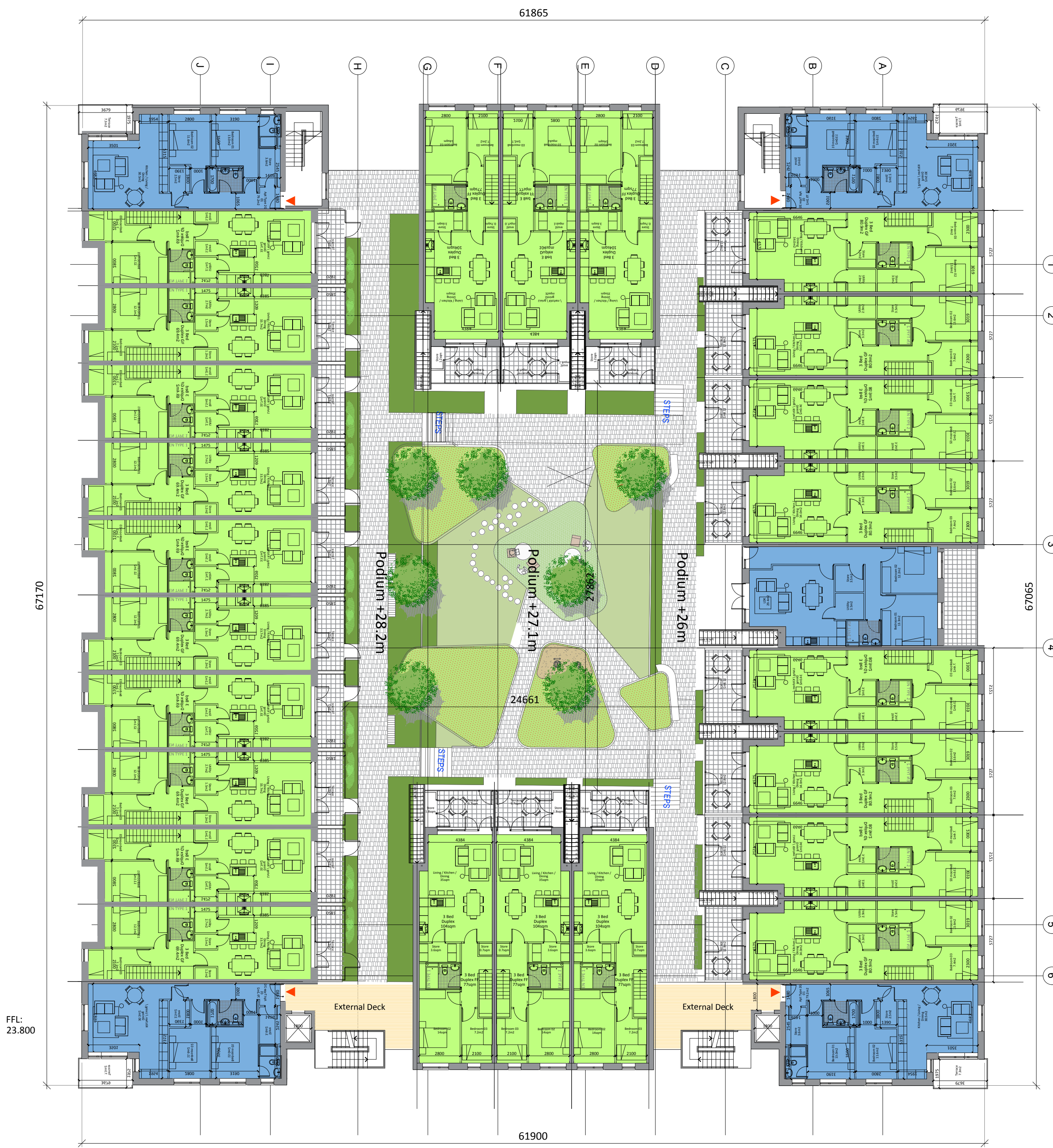
FIRST FLOOR PLAN_LEVEL 01 1:200