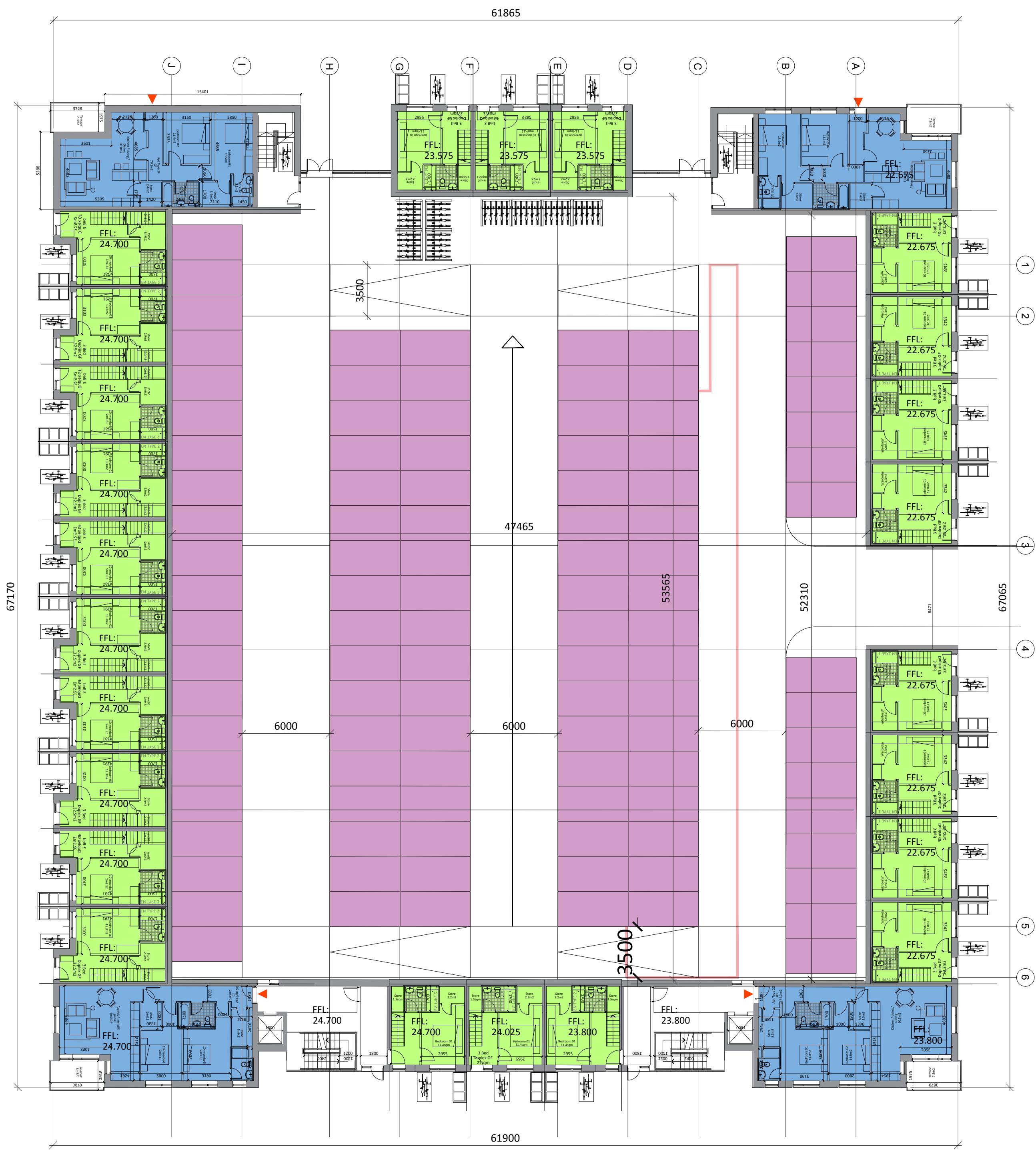
GROUND FLOOR PLAN_LEVEL 00 1:200